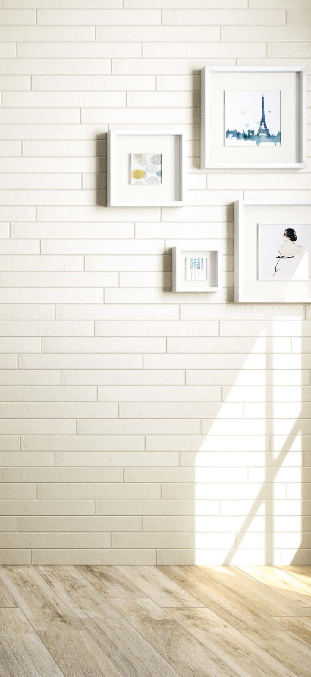
Ivory 6,5x50,2 pav. Focus Cinder 16x99,5